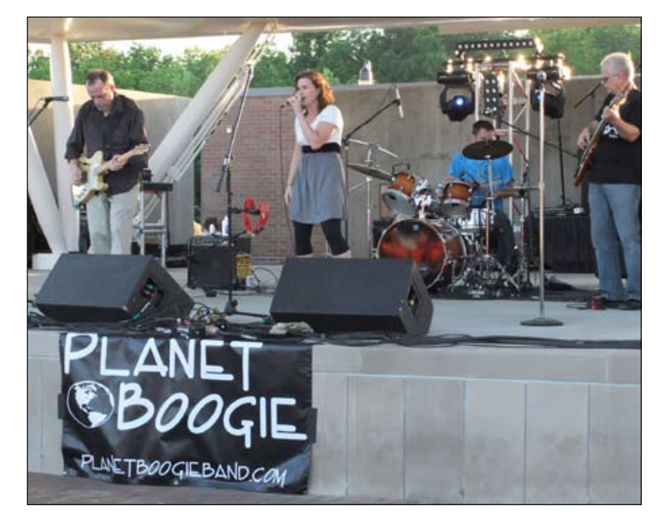
Festivities provided ample supplies of nourishment, musical entertainment... and even robot demonstrations by the St. Louis County Police Department.