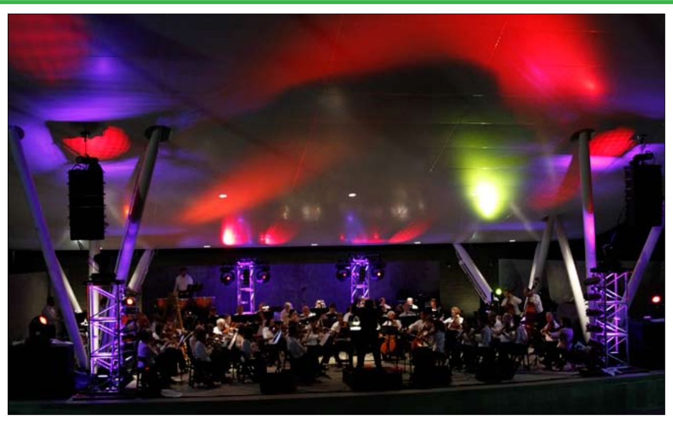
The St. Louis Civic Orchestra helped kick off Dedication weekend, with lights contributing to the dramatic setting.