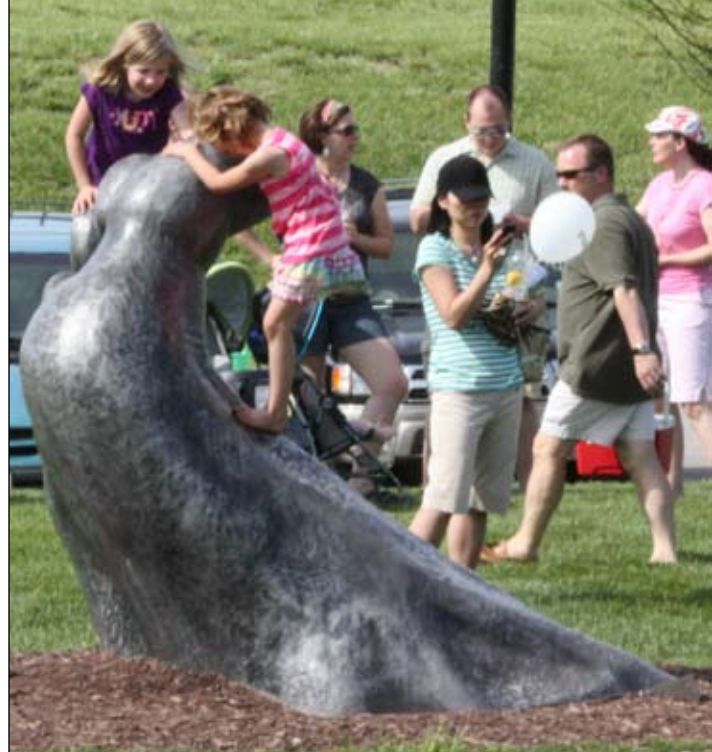
Attendees had many activities from which to choose, including a car show, food & games, or just soaring to new heights with sculpture.